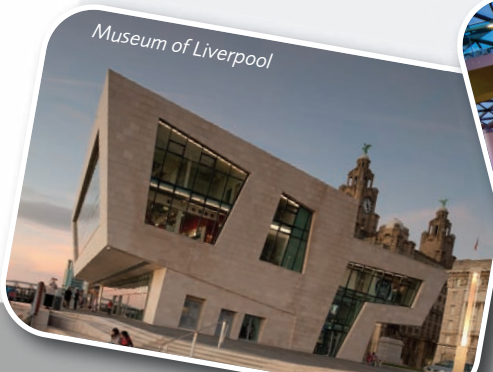
Museum of Liverpool